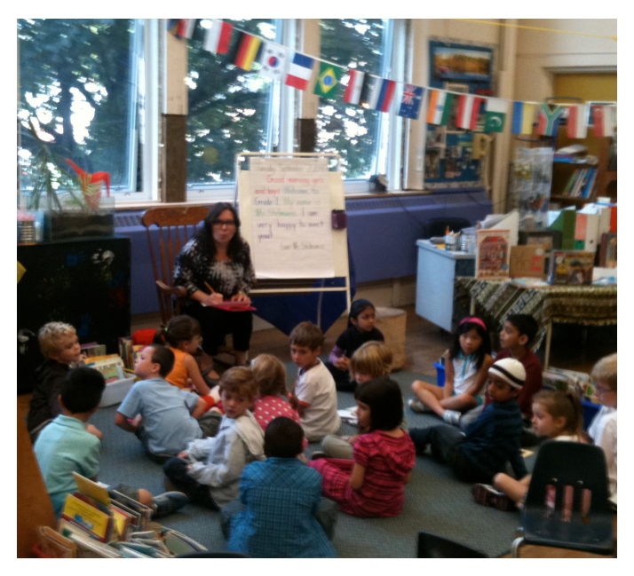
Grade 1 students are happy with the new windows.

746 Danforth Ave., Tel: 416.405.8484 info@copycatreproductions.com