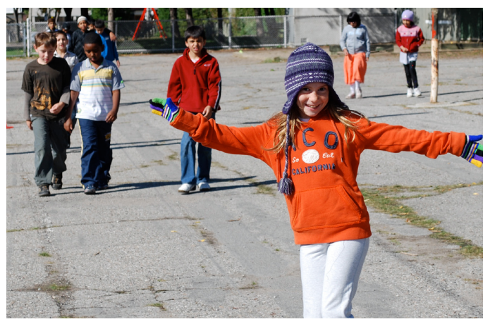
The Wilke Walkathon was a gigantic success raising well over $3000.00 for the Pakistan Relief Fund.